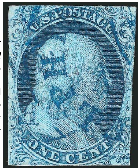
US #5 Benjamin Franklin One of several different types of this issue.